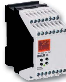
Universal measuring relay MH 9300