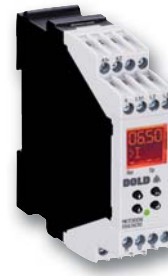
Universal measuring relay MK 9300N