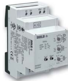
Insulation monitor RN 5897/300