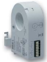
Current transformer ND 5013/024