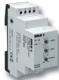
Energy meter RL 9405